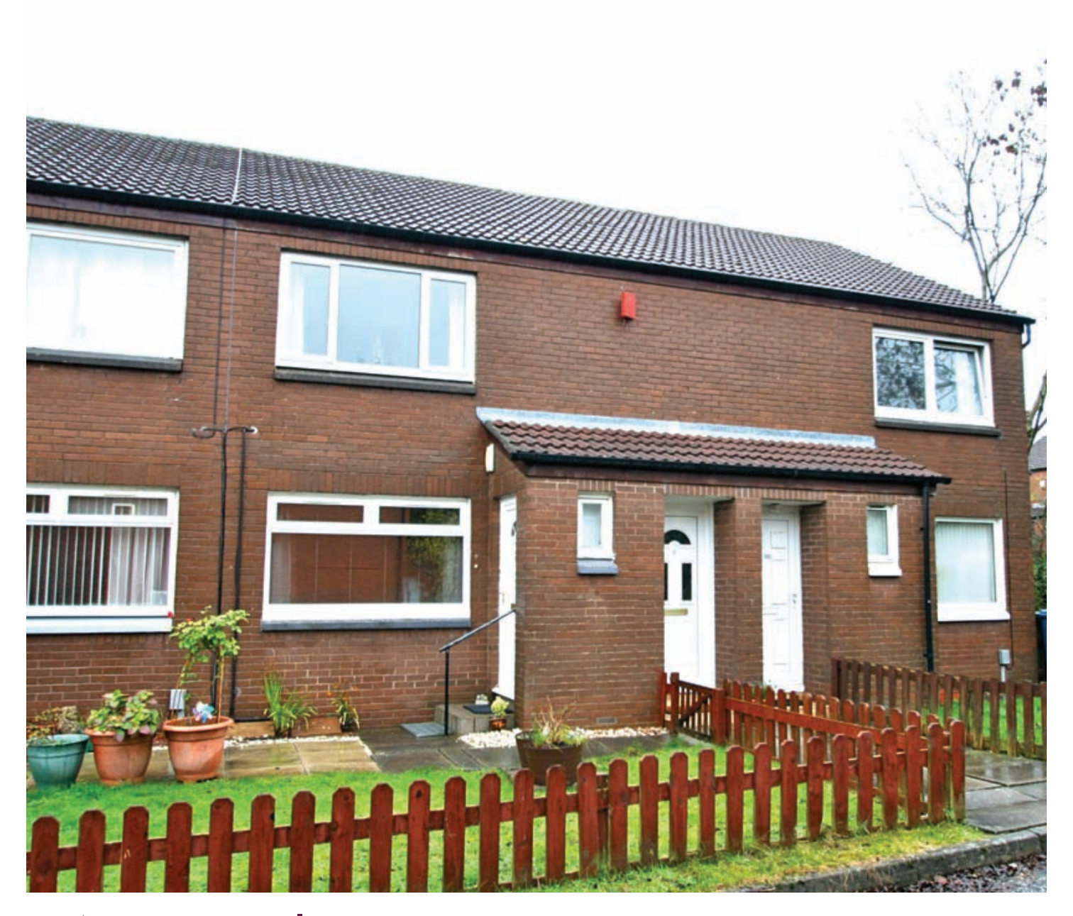
8 Newcastleton Drive, Summerston G23 5LJ Offers over £65,000